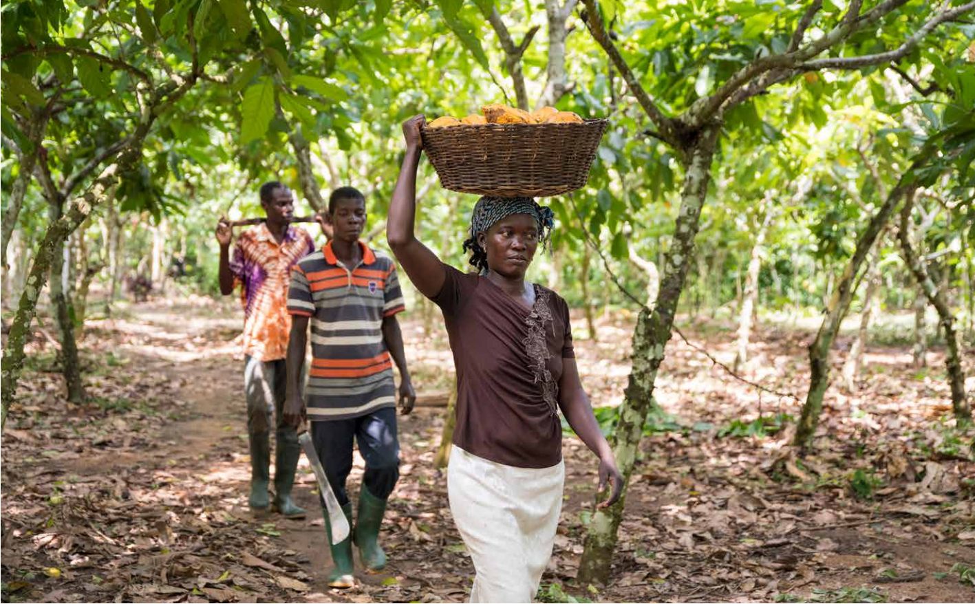
Below: A women carries a basket of freshly cut cocoa pods, followed by her husband, at a farm in the Kokoado community of Asikuma Adoben Brakwa, Central Region, Ghana.

The precarious situation of farmers participating in global agri-food supply chains violates internationally recognized human rights standards. The right to an adequate standard of living, which a living income enables, is codified in international human rights treaties and instruments (Article 25 of the UDHR Universal Declaration of Human Rights and article 11 of the International Covenant on Economic, Social and Cultural Rights). The relevance of living income for human rights is also reinforced by the fact that farmer poverty is a root cause for many other human rights issues in global agri-food supply chains (e.g., child labor, forced labor, right to food, right to education). 18