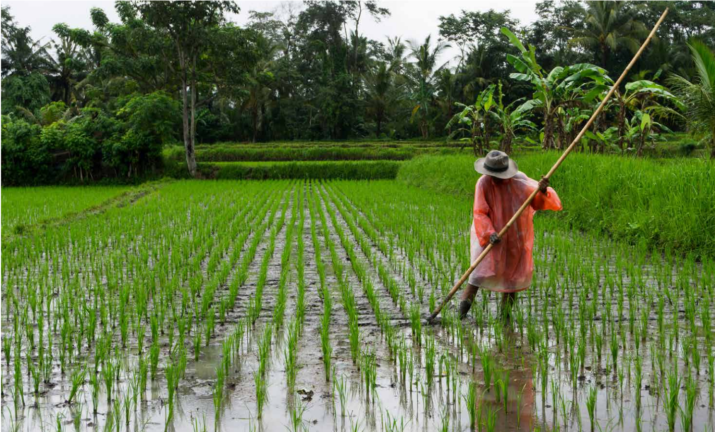
Below: Rice fields on a rainy day. Ubud, Indonesia.

While farm size and income diversity can be complicating factors, they do not eliminate companies' responsibility vis-à-vis farmers to help ensure their ability to earn a living income. Individual companies might not be responsible for closing the entire gap towards a living income (e.g., if farmers only spend a small amount of their labor on the target crop). Yet, at a minimum, companies have the imperative to ensure that their practices and business relationships are not negatively affecting farmers' ability to earn a living income. This imperative includes avoiding procurement practices that impose disproportionate risks on farmers (e.g., debt, volatility), withhold critical resources from farmers (e.g., low prices), create barriers to entry for marginalized farmers (e.g., standard requirements), or inadvertently contribute to the further marginalization of, or negative impacts on, women farmers (e.g., through gender-blind interventions).