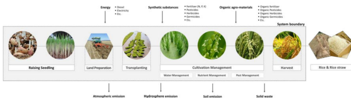
Figure 1. System boundary for rice production in South Korea: gate-to-gate perspective. This system boundary includes raising seedlings, land preparation, transplanting, cultivation management (i.e., water, nutrients, and pest management), and harvest for rice farming of 1 kg.

In general, a cradle-to-gate (CtG) perspective is the standard system boundary for crop production systems [50]. However, the system boundary is set up for the present study according to a gate-to-gate (GtG) principle, excluding the consumption and disposal stages since endemic databases for chemical materials used in the agricultural sector have not been established yet in South Korea. The system boundaries for rice farming systems are illustrated in Figure 1.