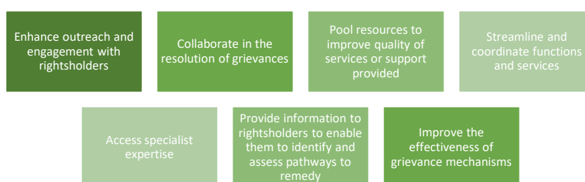
Figure 1 – Value of Partnerships in Implementing Grievance Mechanisms

For VSS organizations, working with third party partners could be essential to extending the capacity of VSS-level grievance mechanisms. VSS organizations may not have sufficient in-house capacity to support all the functions required in operating an effective grievance mechanism. In these instances, working with third party partners could bring additional resources to the table to enhance the effectiveness of the grievance mechanism. Most mechanisms have limited budget and capacity for outreach to rightsholders and affected stakeholders and may rely upon CSOs to act as intermediaries.