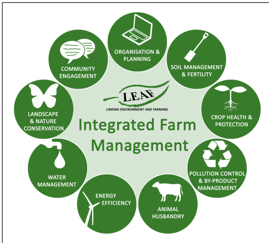
Figure 1 - LEAF Integrated Farm Management (IFM)

environment and engages local communities. The aim of IFM is to stimulate continuous improvement in the businesses and therefore motivate businesses into innovative practices.