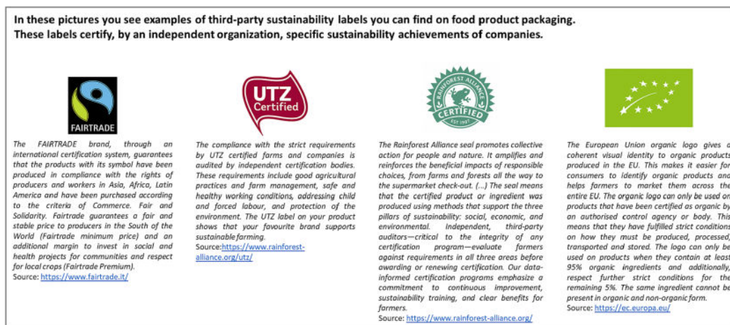
Fig. 2. The four third-party sustainability labels shown as examples to the respondents. The accompanying descriptions were taken from the websites of the issuing organizations.

Once the goodness of the measurement model was verified, the fit of the structural model was evaluated. Regarding the incremental fit measures, the values of the comparative fit index (CFI) (Bentler, 1990) and Tucker-Lewis index (TLI) (Bentler & Bonnett, 1980; Tucker & Lewis, 1973) are very close to 1 (CFI = 0.998; TLI = 0.998), denoting a good fit of the hypothesized model. The exact fit of the model was also examined, calculating the standardized root mean square residuals (SRMR) index (Bentler, 1995; Jöreskog & Sörbom, 1981). The SRMR estimates the mean of the residual correlation whose value (0.053) denotes a good fit since values below 0.08 are recommended for this index (Hu & Bentler, 1998). Then, the absolute fit was considered, calculating the root mean squared error of approximation (RMSEA) index (Steiger & Lind, 1980; Browne & Cudeck, 1993). In this regard, the accepted values of RMSEA should be lower than 0.08 (MacCallum et al., 1996), and the goodness-of-fit index (GFI) must be at least equal to 0.95 (Jöreskog & Sörbom, 1986); accordingly, that was the case in this study (RMSEA = 0.015; GFI