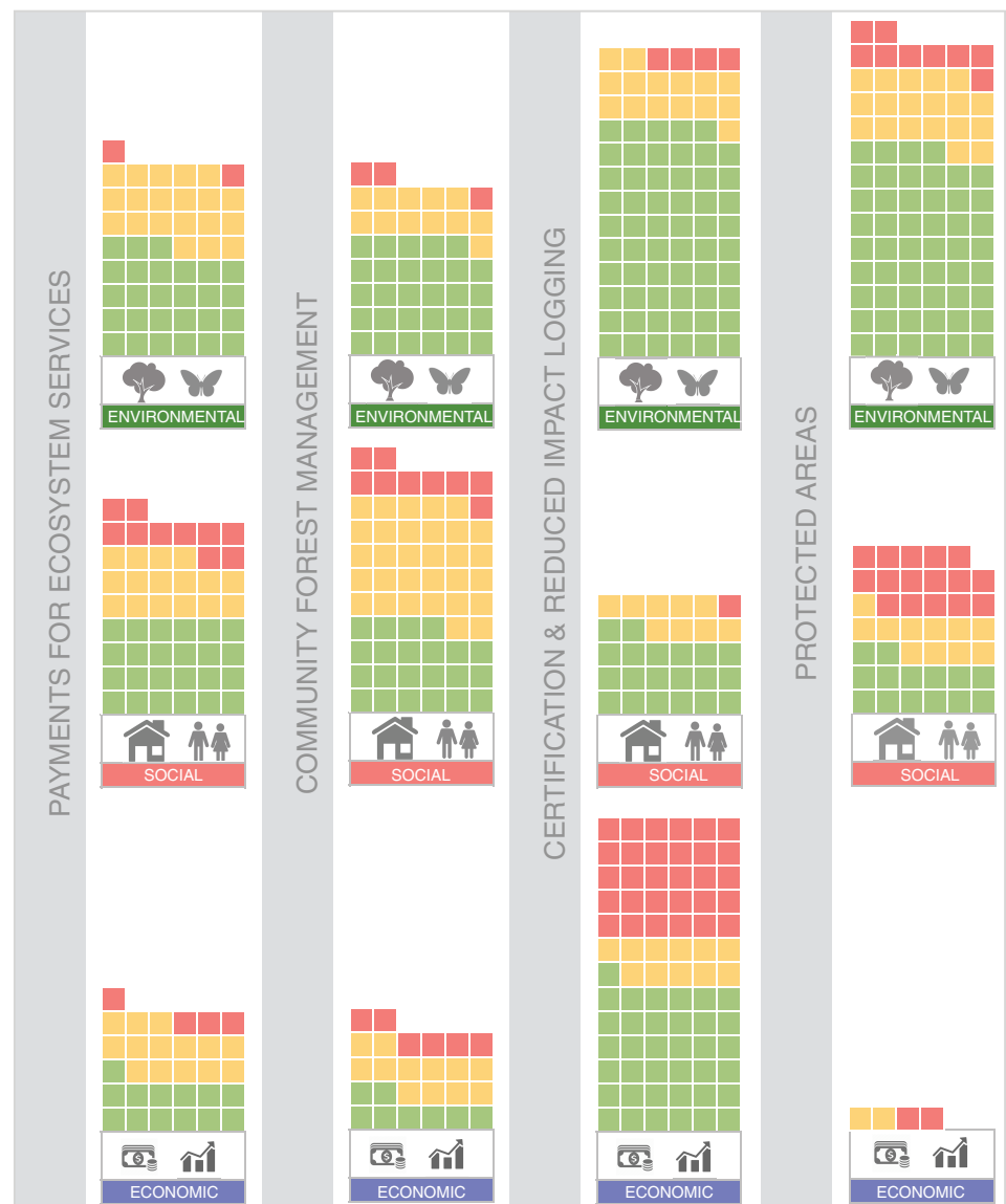
FIGURE 2 Overview of the evidence on the outcomes of four different conservation strategies (columns) in terms of environmental, social, and economic outcomes (rows). Red squares, negative outcomes (i.e., intervention worse than control); yellow, neutral; green, positive outcomes. Individual squares do not have equal value, cannot be cancelled out, and summarized into overall effect sizes, see limitations

(13 data points on illegal hunting, logging, and mining). Second, biodiversity is far more difficult and expensive to measure than deforestation, which can be relatively reliably estimated from satellite imagery (Hansen et al., 2013).